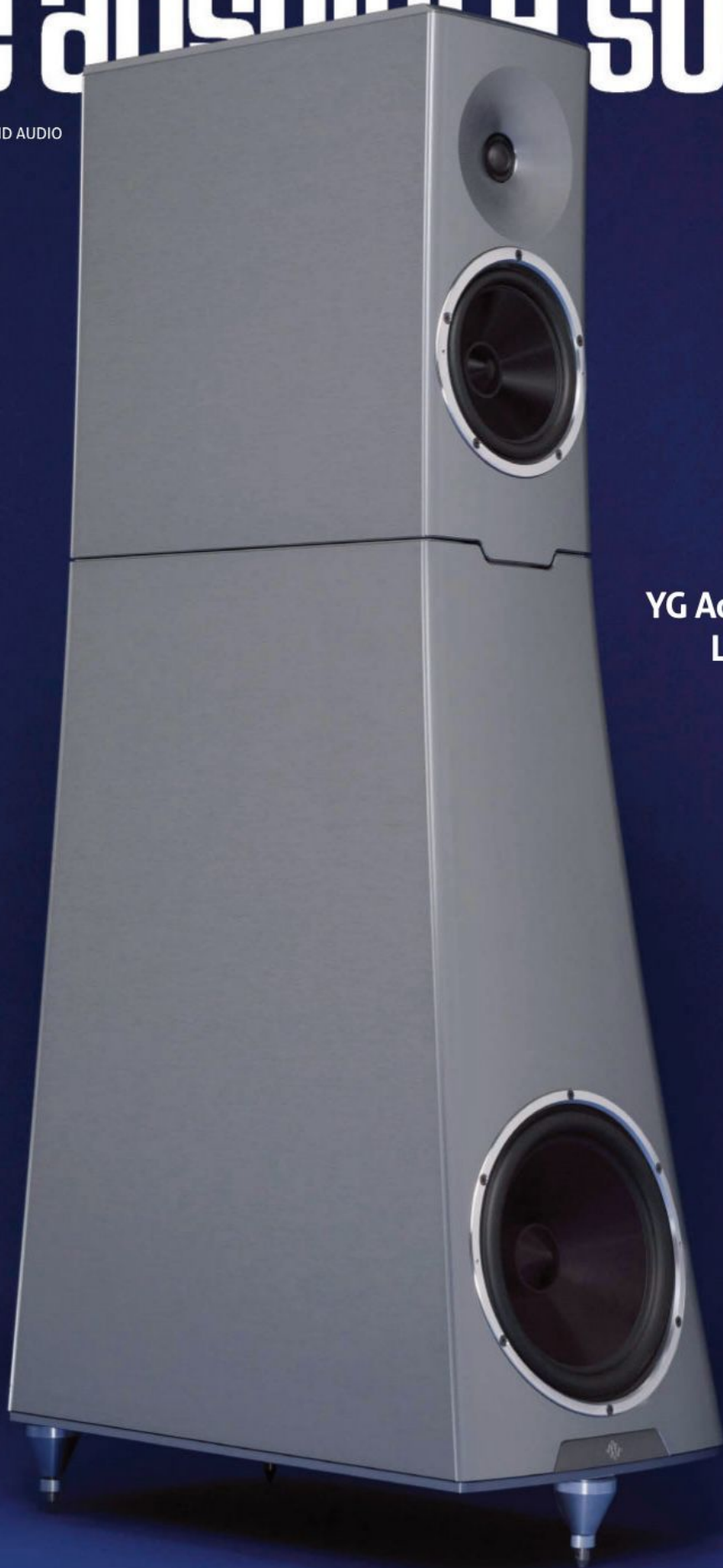
YG Acoustics Hailey 3 Loudspeaker